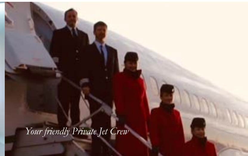
Your friendly Private Jet Crew