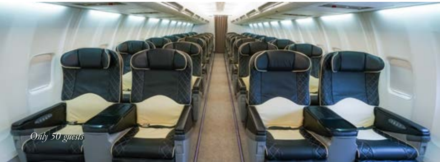
Only 50 guests

We will assist you with obtaining the obligatory travel insurance and help with immigration requirements and visas.