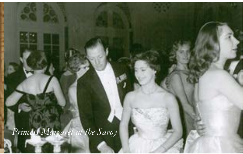
Princess Margaret at the Savoy