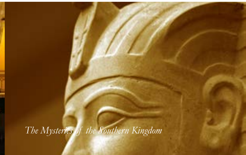
The Mysteries of the Southern Kingdom