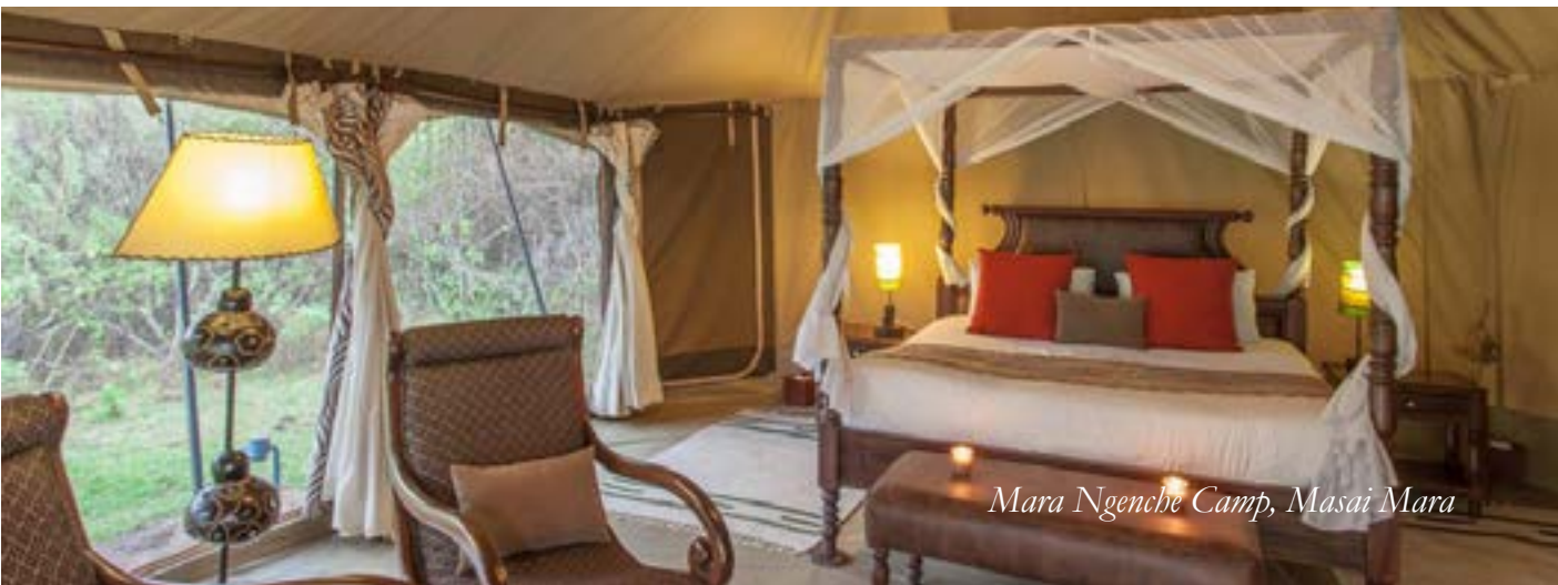
Mara Ngenche Camp, Masai Mara

Your Camp will communicate your programme daily but feel free to highlight any special requests during your stay.