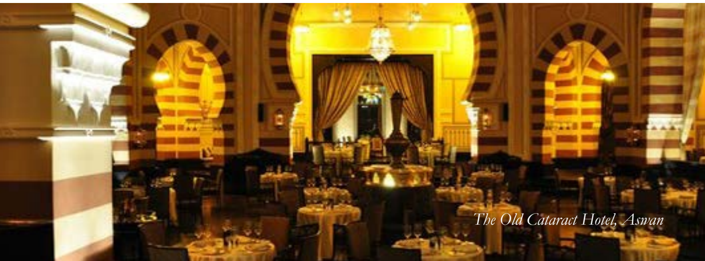
The Old Cataract Hotel, Aswan

Please note: all meals in Egypt, with the exception of hotel in-house dining, will only offer non-alcoholic beverages, all of which are included in your Expedition fare.