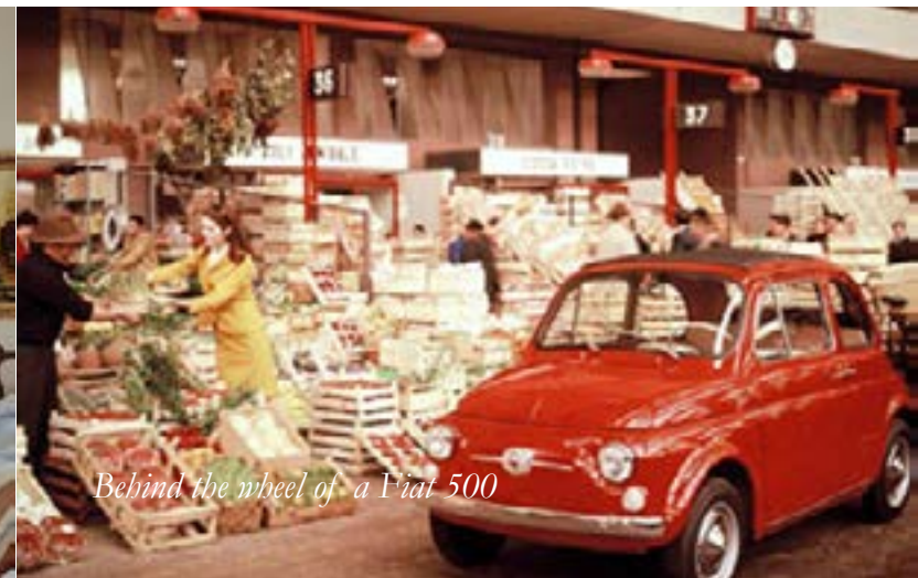
Behind the wheel of a Fiat 500