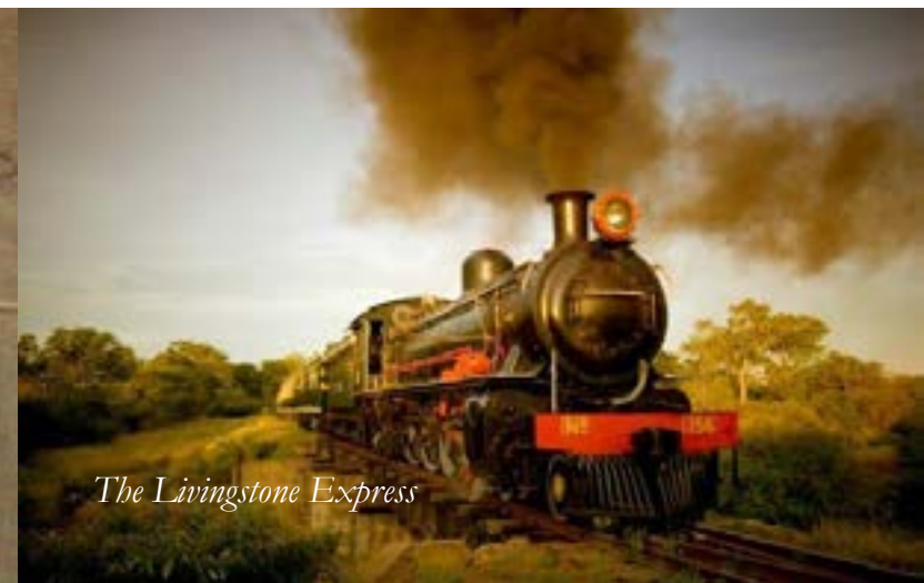
The Livingstone Express