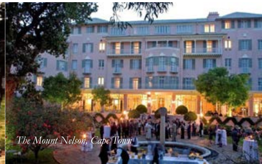
The Mount Nelson, Cape Town