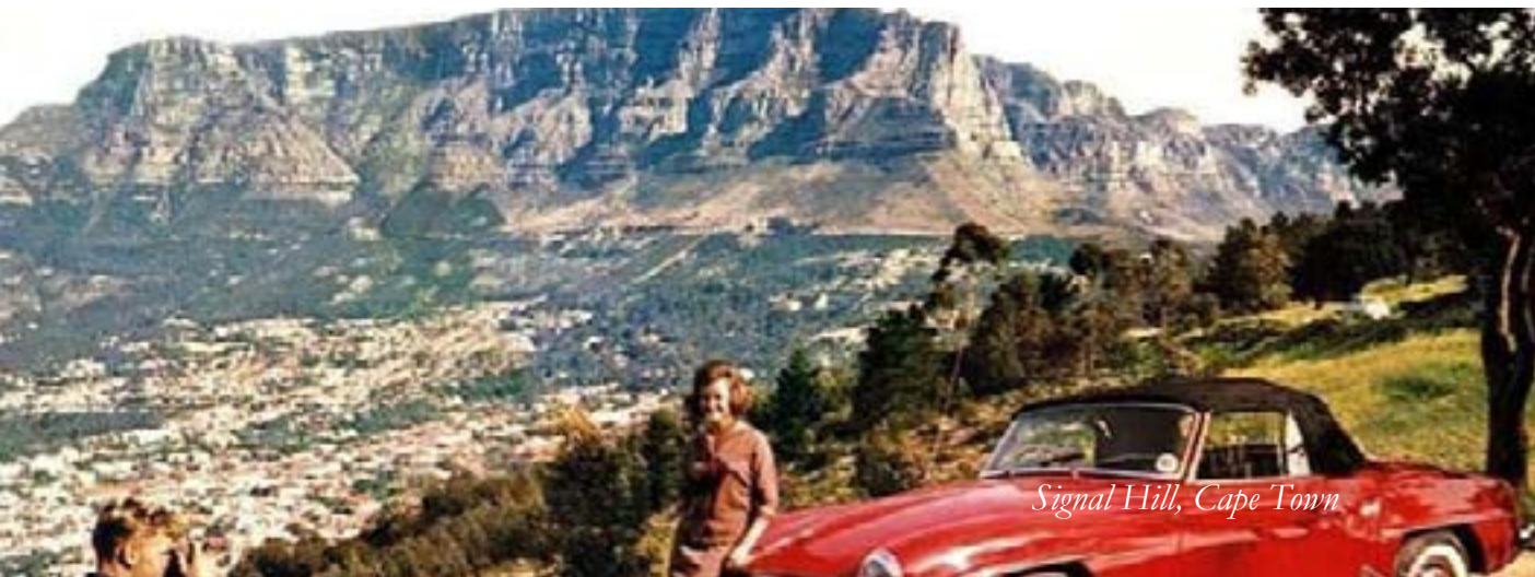
Signal Hill, Cape Town

After breakfast, time to say good bye to our team and new found friends with a transfer to Cape Town Airport this afternoon. Alternatively, why not extend your stay in South Africa or visit neighbouring Namibia, Botswana or Mozambique or travel out to the sun in Mauritius or the Seychelles. Your Vintage Travel Team will be happy to assist with extending your stay.