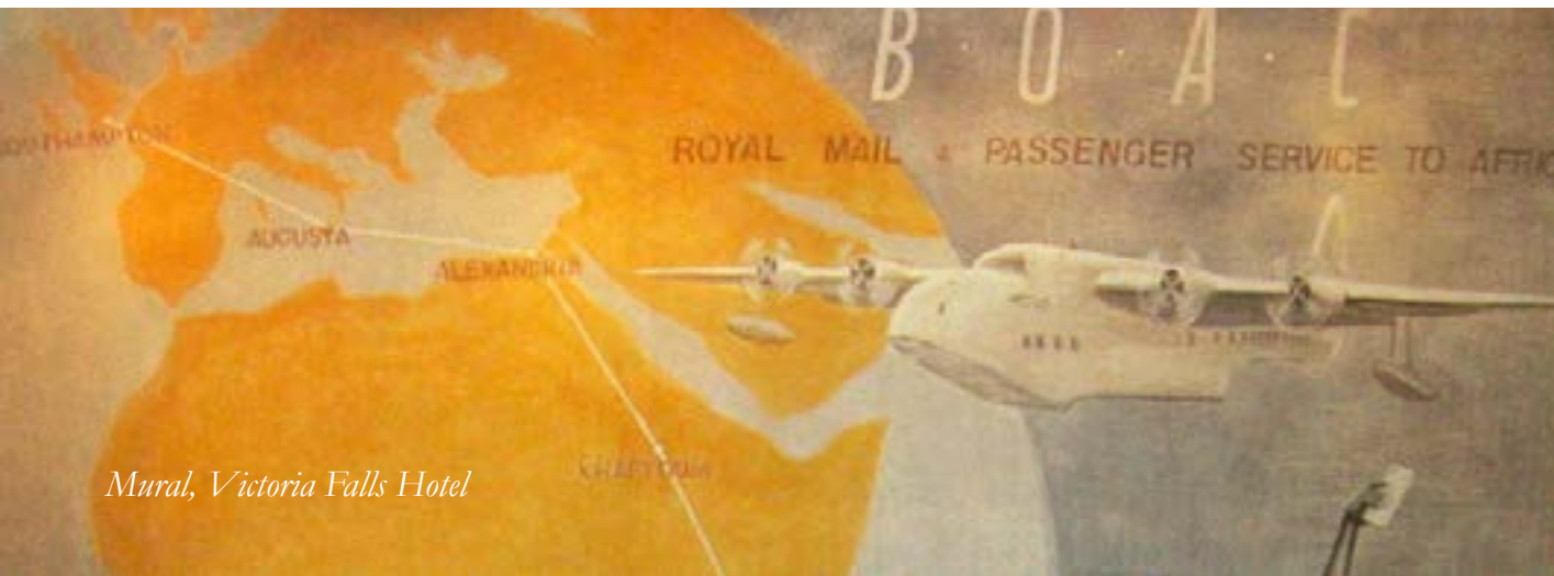
Mural, Victoria Falls Hotel

This evening we board the historic Livingstone Express, a vintage train set for dinner, stopping on the Victoria Falls Bridge.