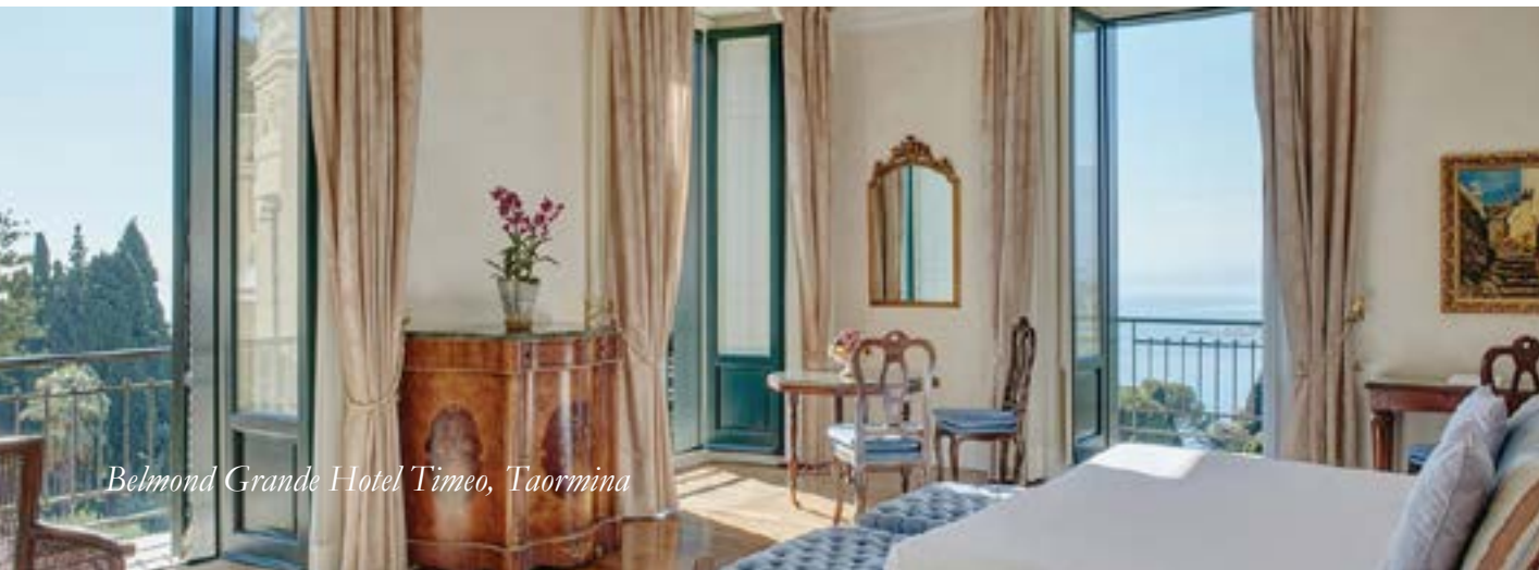
Belmond Grande Hotel Timeo, Taormina

We travel tonight to the Belmond Villa St Andrea to dine alongside the Ionian